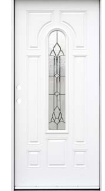
FM280D* White, Mahogany or Dark Walnut with decorative glass