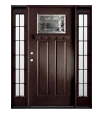
FM300A Medium Walnut or Dark Walnut with decorative glass and dentil shelf

SIZE: 37 <sup>1</sup>/<sub>4</sub> x 81"