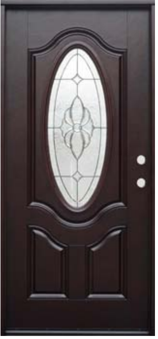
FM800A* Dark Walnut or Mahogany with decorative glass

Triple-glazed, LowE tempered glass with Argon gas