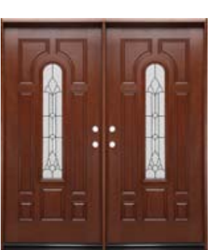
Note: Sidelites not available in White.

*Double door size 61.5 x 81" available with FM800A, FM280D, FM285B.